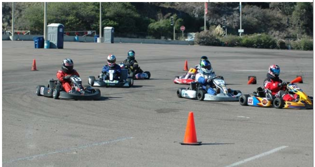
There are many lines thru a corner! TaG-USA Seniors September 16th - Qualcomm Stadium