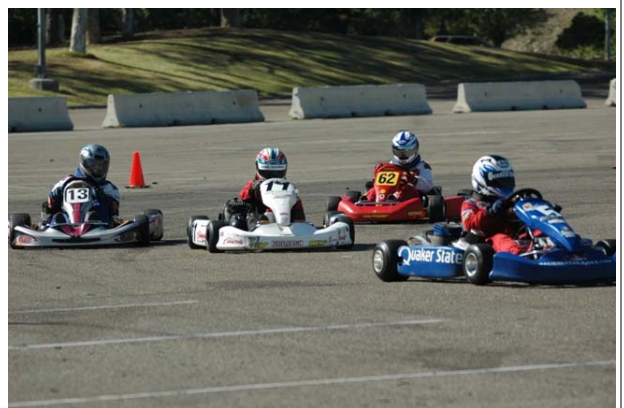
September 16th - Qualcomm Stadium Turn #1 - HPV2