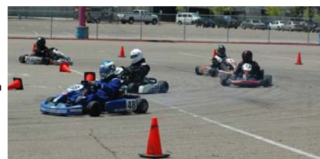
April 28, 2007 - Qualcomm Southeast Course

Have you been up to Apex for some seat-time? Are you ready to race?