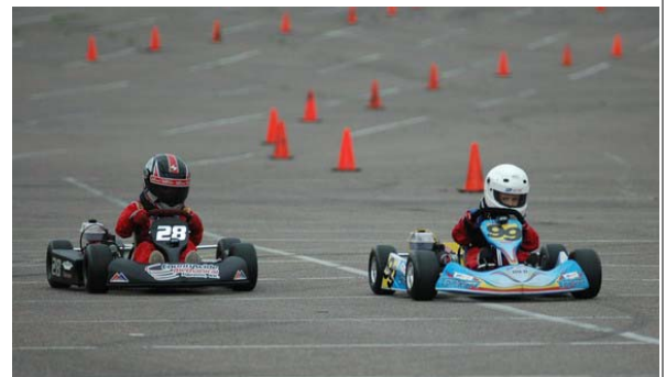
April 7, 2007 - Qualcomm West Course