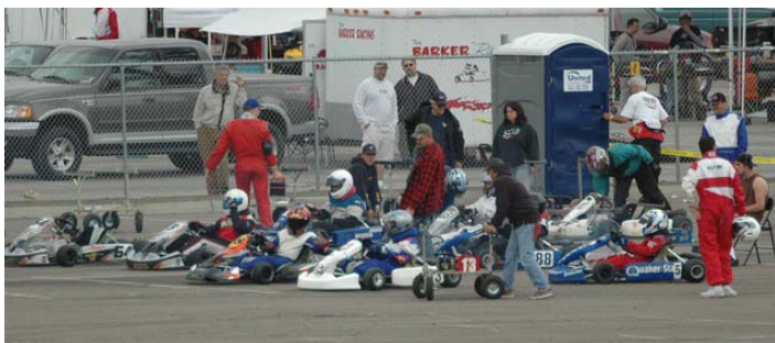
April 7, 2007 - Qualcomm West Course - Reverse