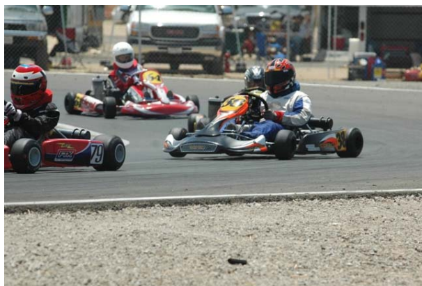
June 9th - Apex Raceway HPV 2 Junior

Did you know? Fully charging your AMB TranX160 Transponder takes 14-hours . When fully charged, you see 3 green blinks from the LED; 1 blink for each day the full charge should last. Don't begin a race day with only 1 blink!