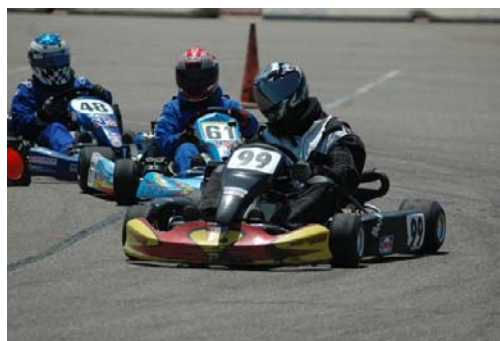
July 8th - Qualcomm Stadium Go-Karting TaG-USA Senior