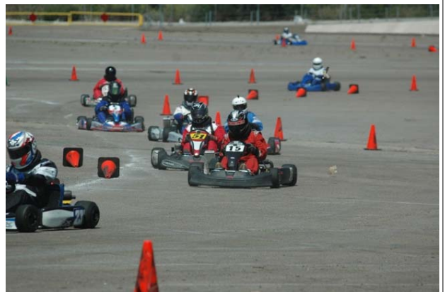
July 8th - Qualcomm Stadium Full Throttle Karting TaG-USA Heavy